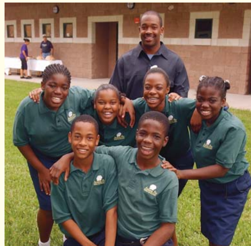
Shaun King with students at Grand Opening of Academy Prep Center of Tampa