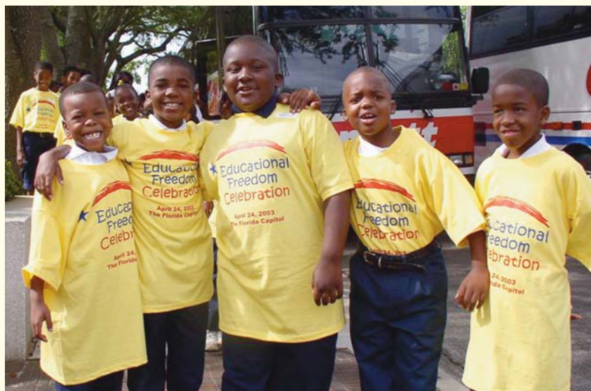
Students show their support at last year's Rally in Tally.

Transportation and lunch will be provided! Space is limited, so sign up now.