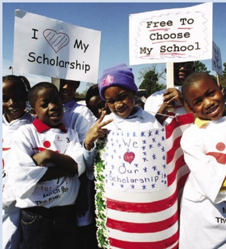
Students from Tallahassee's Innovation School of Excellence show their support for school choice.